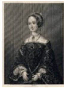
Marguerite De Navarre Oct. 1