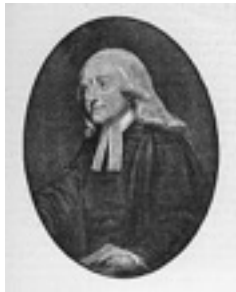
John Wesley Oct. 15