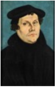
Martin Luther Sept. 17