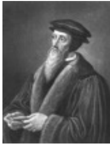
John Calvin Sept. 24