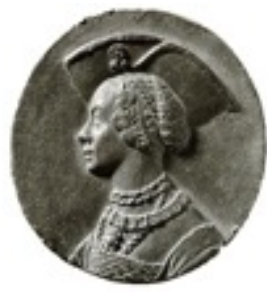
Argula Von Grumback Oct. 22